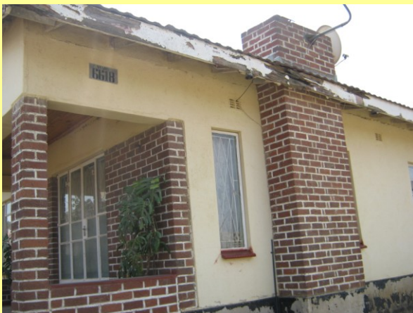
The front of our first home